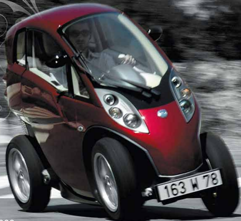
Lumeneo Smera / production, 2008

Innovation pour la mobilité individuelle