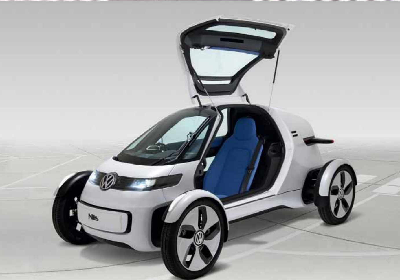
Volkswagen Nils / concept, 2011