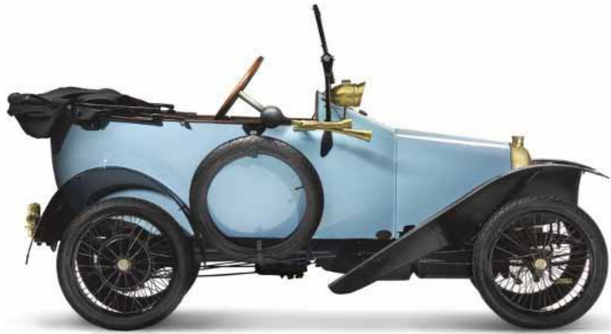
Ettore Bugatti for Peugeot, B b  Type BP1 / production, 1913