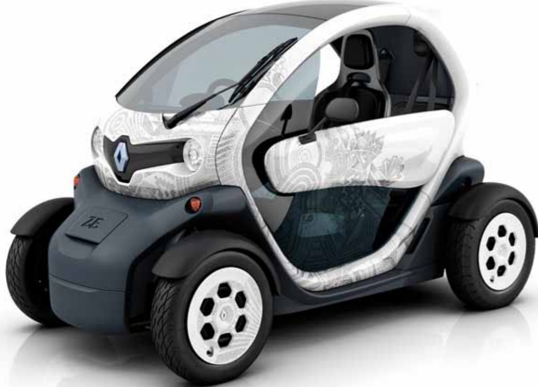
Renault Twizy / production, 2011