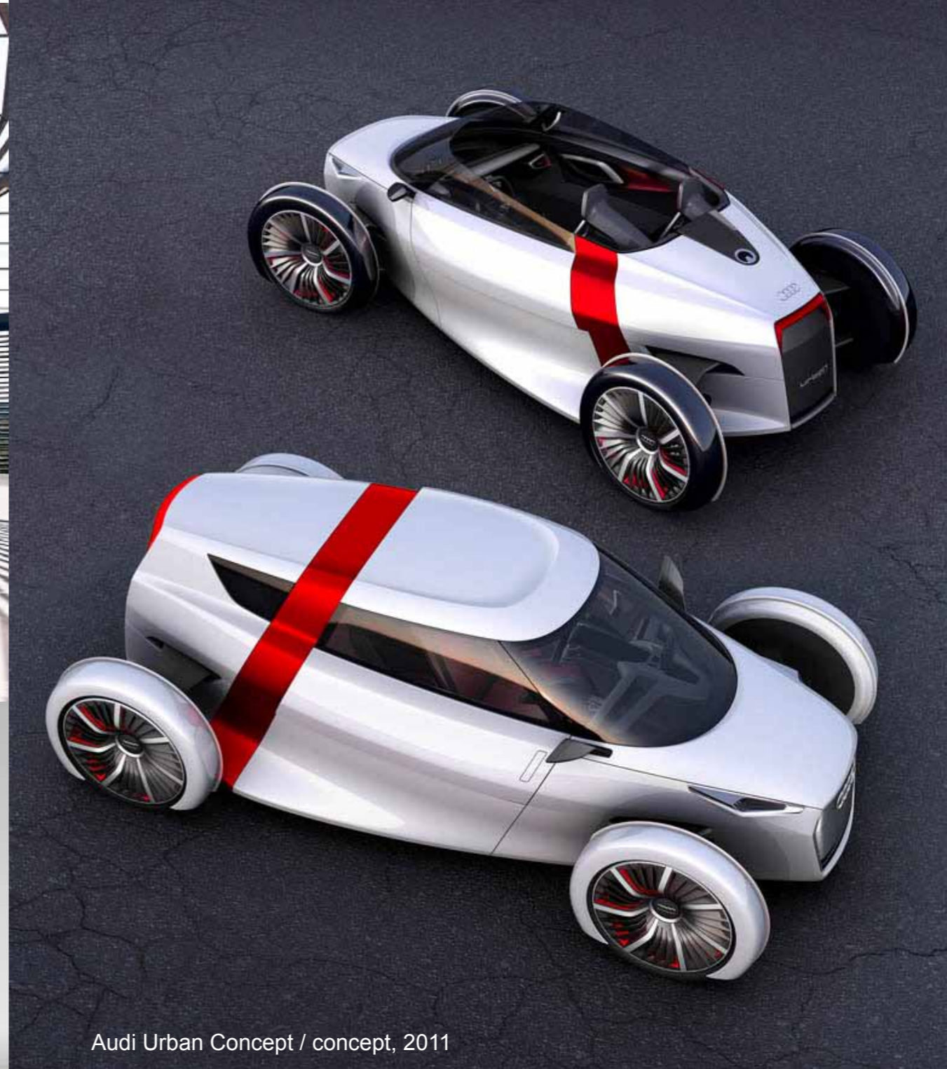
Audi Urban Concept / concept, 2011