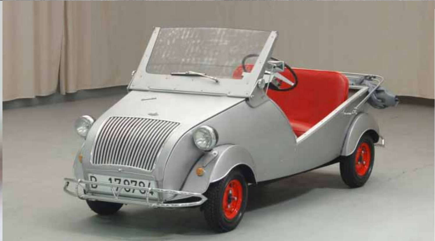
Voisin Biscuter / production, 1964