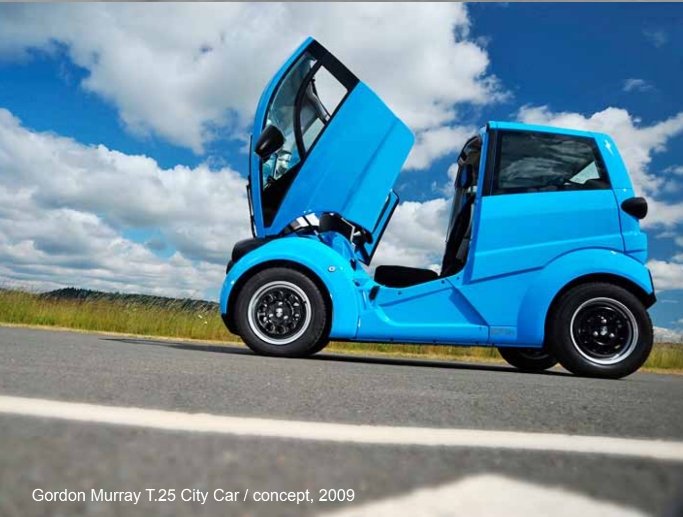
Gordon Murray T.25 City Car / concept, 2009