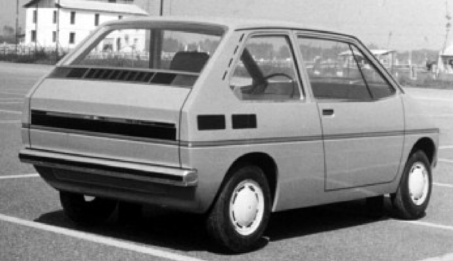
Suzuki Microutilitaria Italdesign / concept, 1969