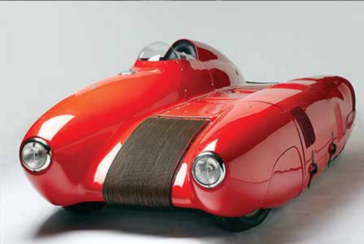
Nardi- Giannini 750 Bisiluro / one-off racing car, 1955