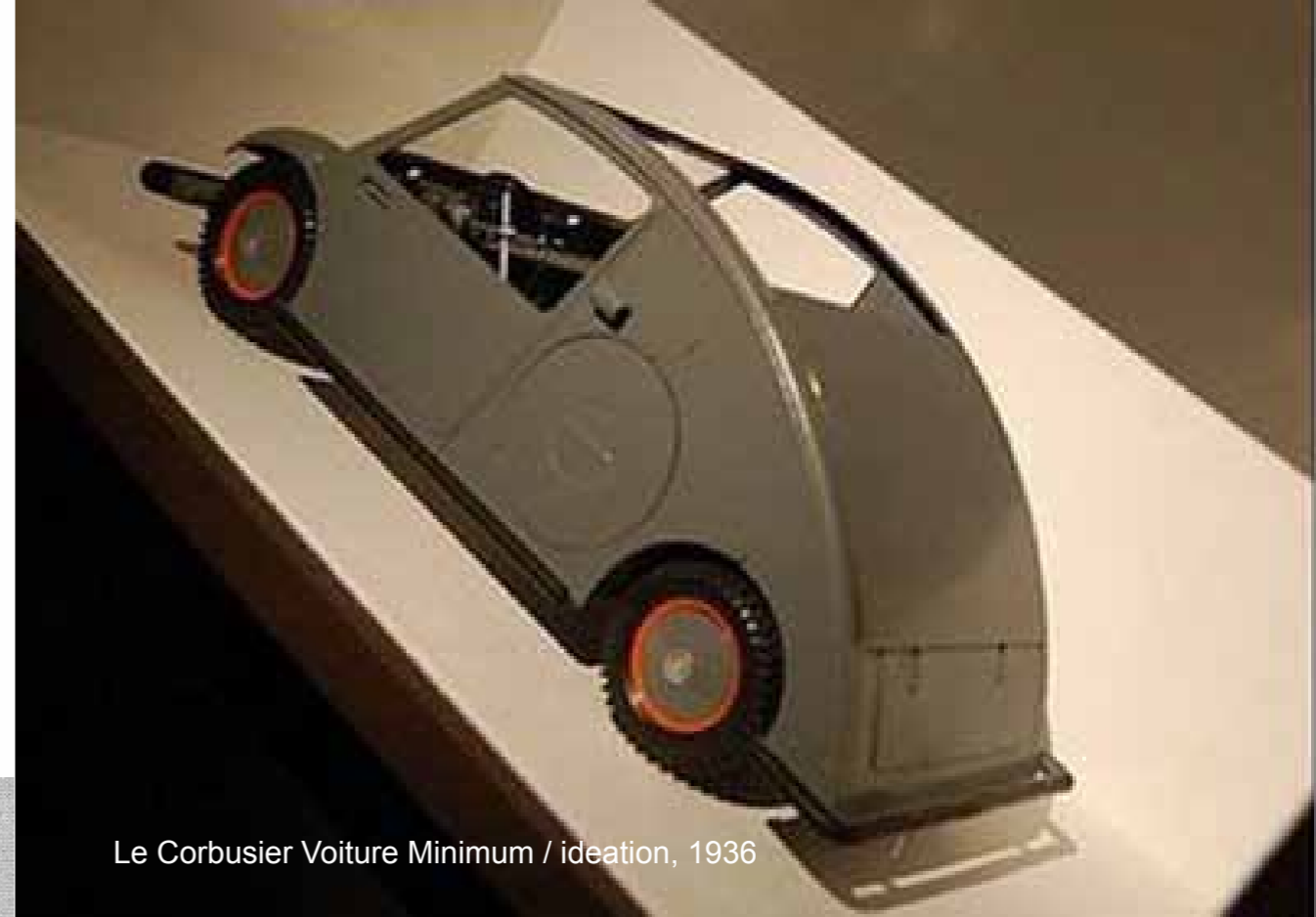
Le Corbusier Voiture Minimum / ideation, 1936