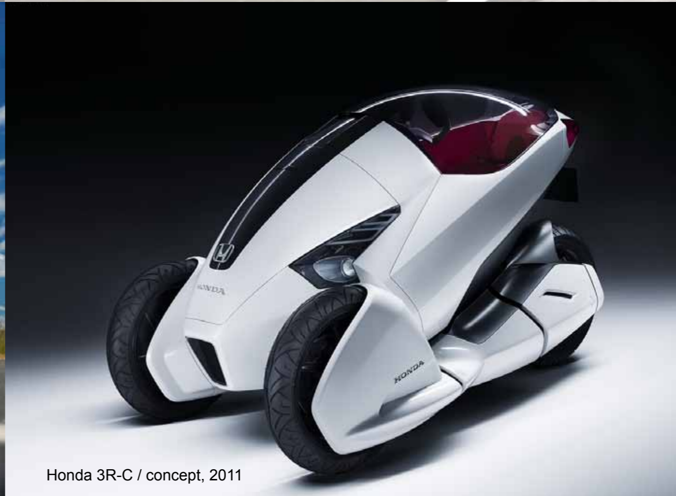
Honda 3R-C / concept, 2011