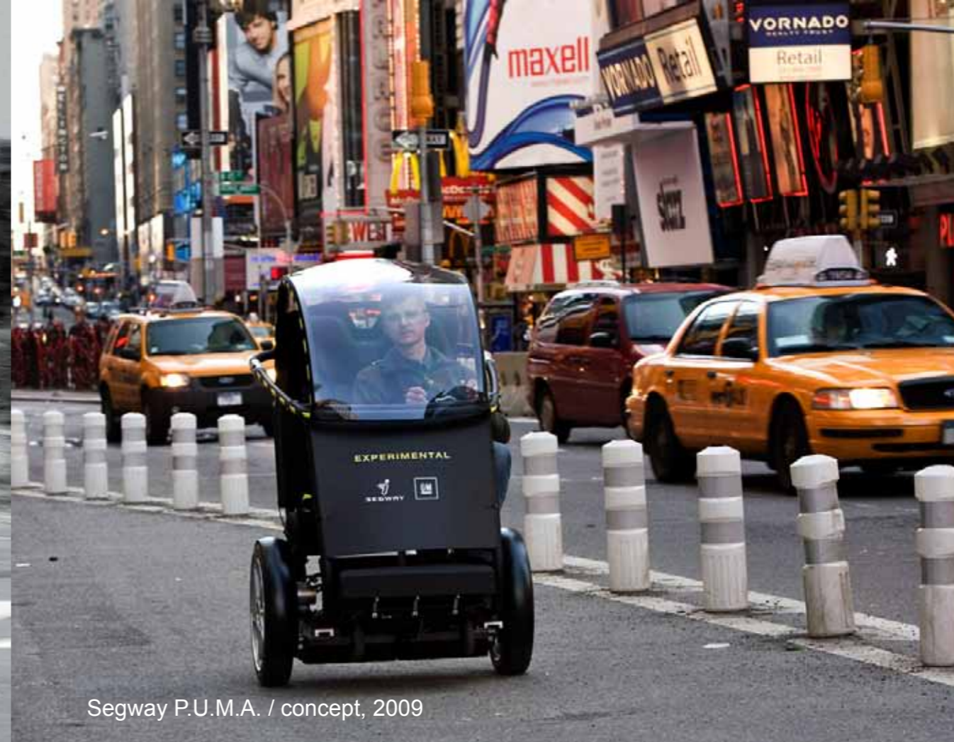
Segway P.U.M.A. / concept, 2009