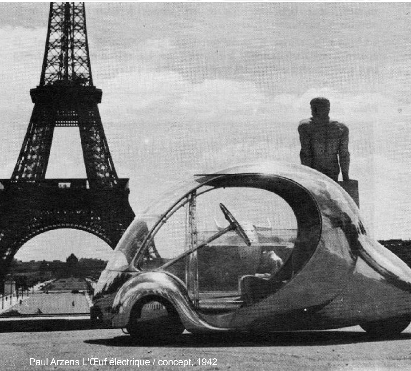
Paul Arzens L' uf  lectrique / concept, 1942