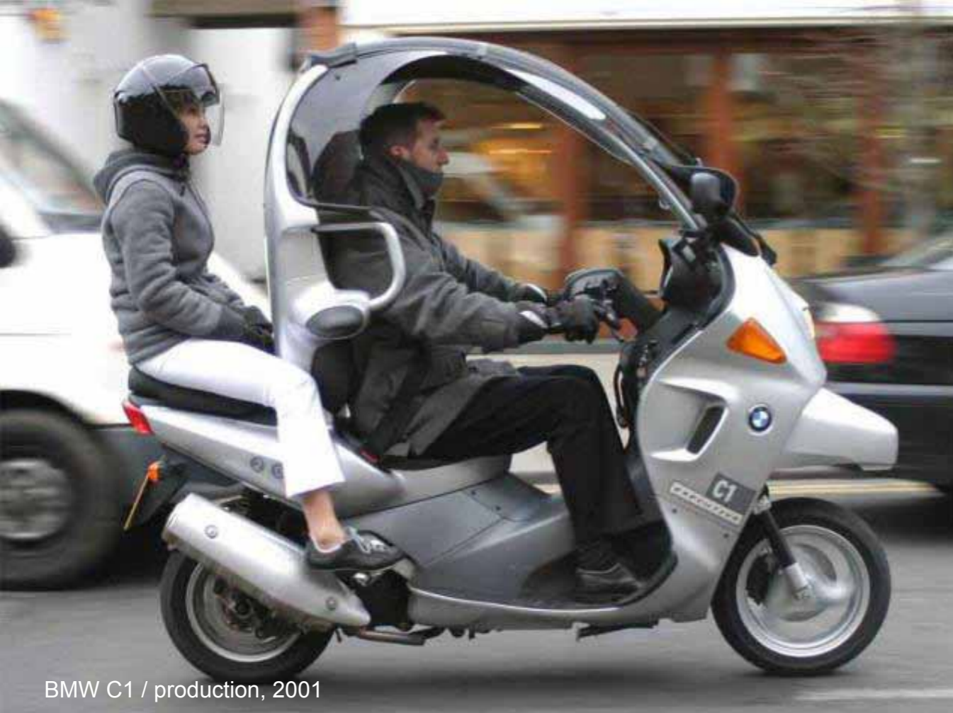
BMW C1 / production, 2001