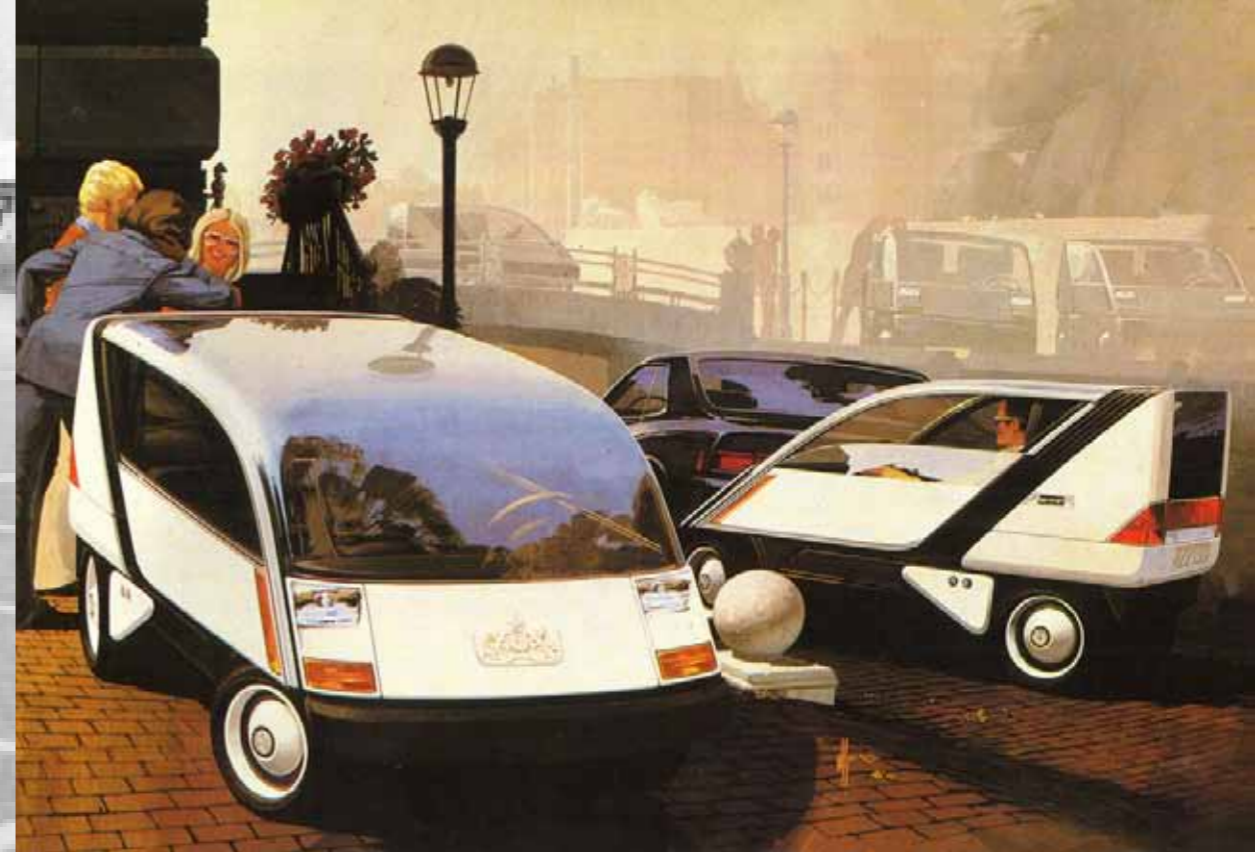
Syd Mead for Philips / ideation, 1970