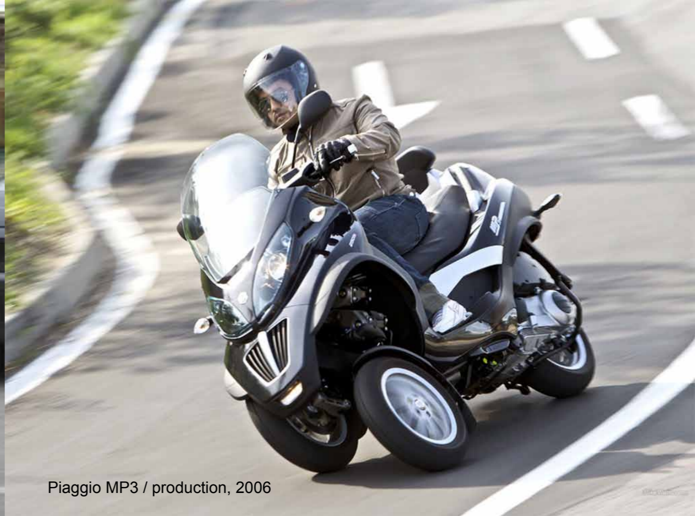
Piaggio MP3 / production, 2006