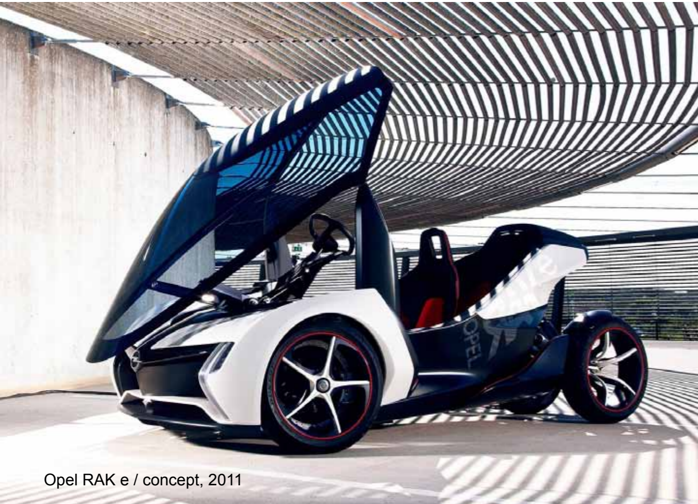
Opel RAK e / concept, 2011