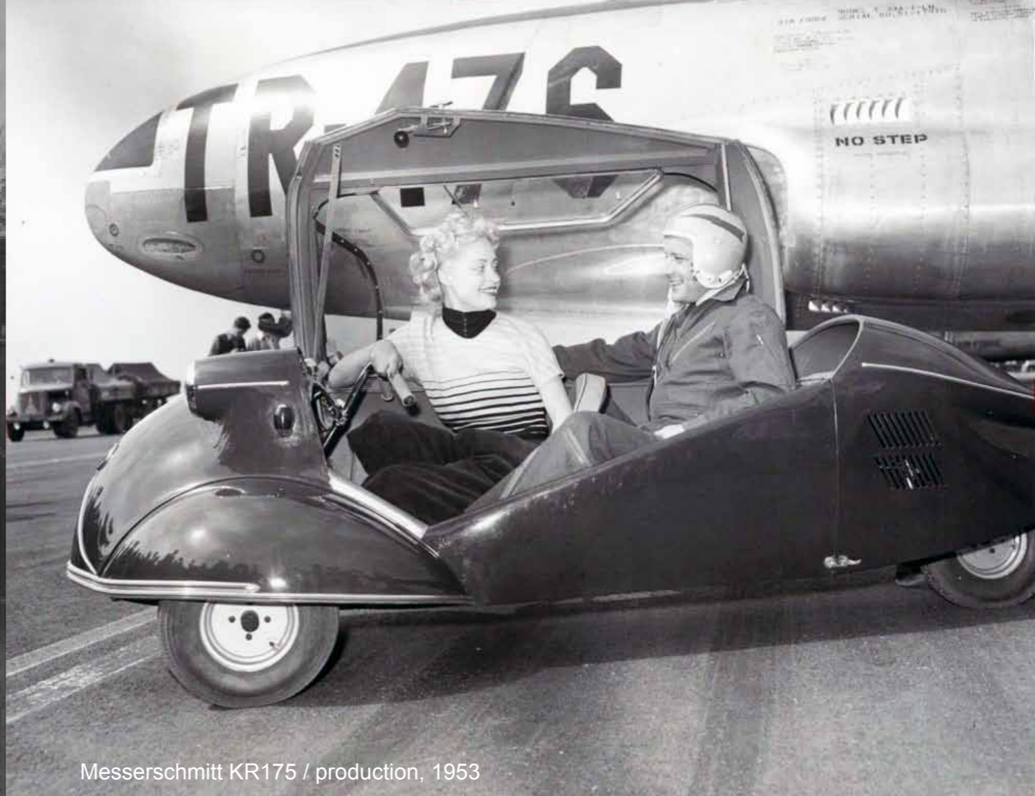
Messerschmitt KR175 / production, 1953