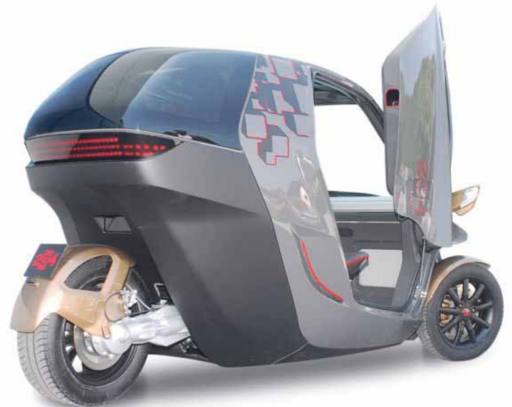
KTM E3W / concept, 2011